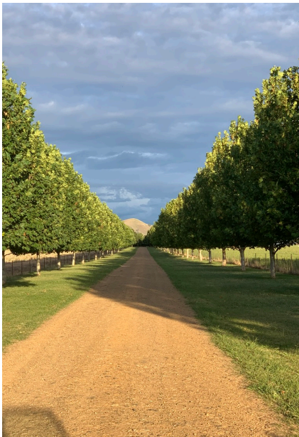
London Plane Tree Driveway